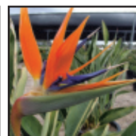
Bird of Paradise (Strelitzia reginae)

New Zealand Flax (Phormium hybrids) Striking leaf color variations!